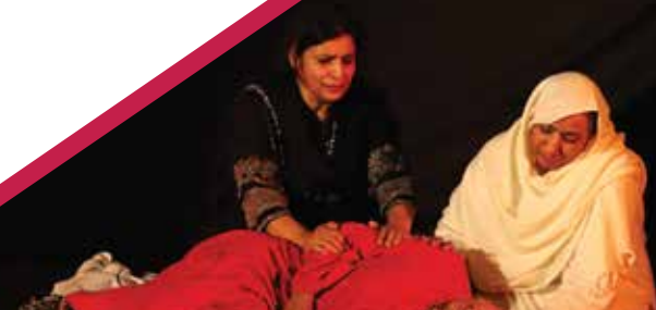
Ajoka Actors On Stage

The Centre for Business and Society was inaugurated at Suleman Dawood School of Business on January 21, 2019. The event marked the evolution of CBS from the Centre for Governance and Public Management (CGPM). As a means of showcasing commitment to social issues and immediate action, CBS commemorated its inauguration alongside the International Day for the Elimination of Violence Against Women and Human Rights Day with a play entitled "Barri" by the Ajoka Theatre.