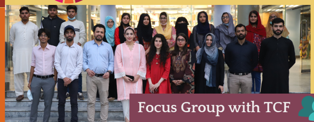
Focus Group with TCF