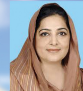
Ms. Anusha Rahman

CEO IMS Knowledge & FranklinCovey Pakistan & Member of PTI