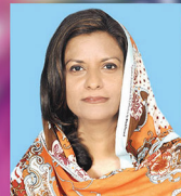
Dr. Nafisa Shah

Executive Director, HomeNet Pakistan and Member of the Punjab Commission of the Status of Women member of PML