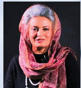
Ms. Masarrat Misbah

Founder of Depilex Saloon and Depilex Smileagain Foundation