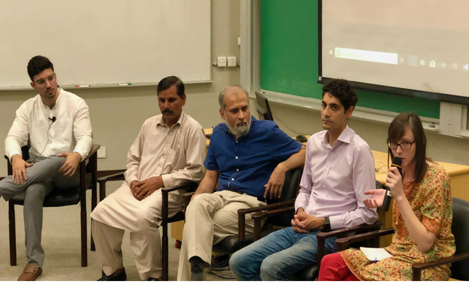
CBS and LUMS Environmental Action Forum (LEAF) panel talk on Toxic Air: